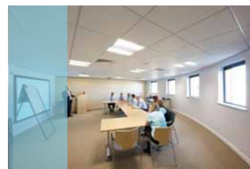
Training Room 1