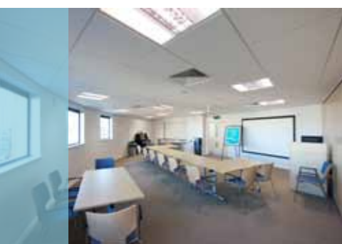
Training Room 1