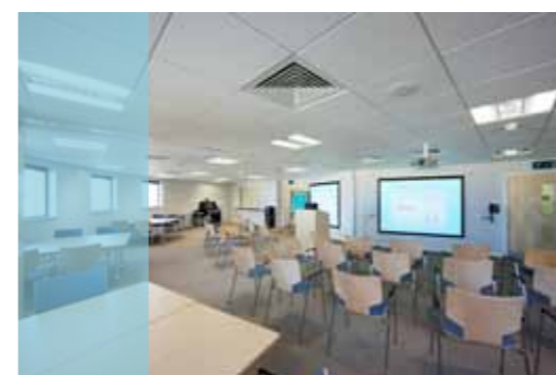
Training Rooms 1 & 2 together