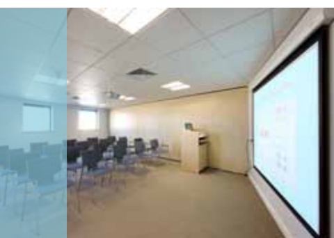
Training Room 2

Training Rooms 1 and 2 (approximate measurement 17.6m wide by 7.6m deep) are divided by a soundproofed rolling wall which folds away to provide a single larger capacity venue.